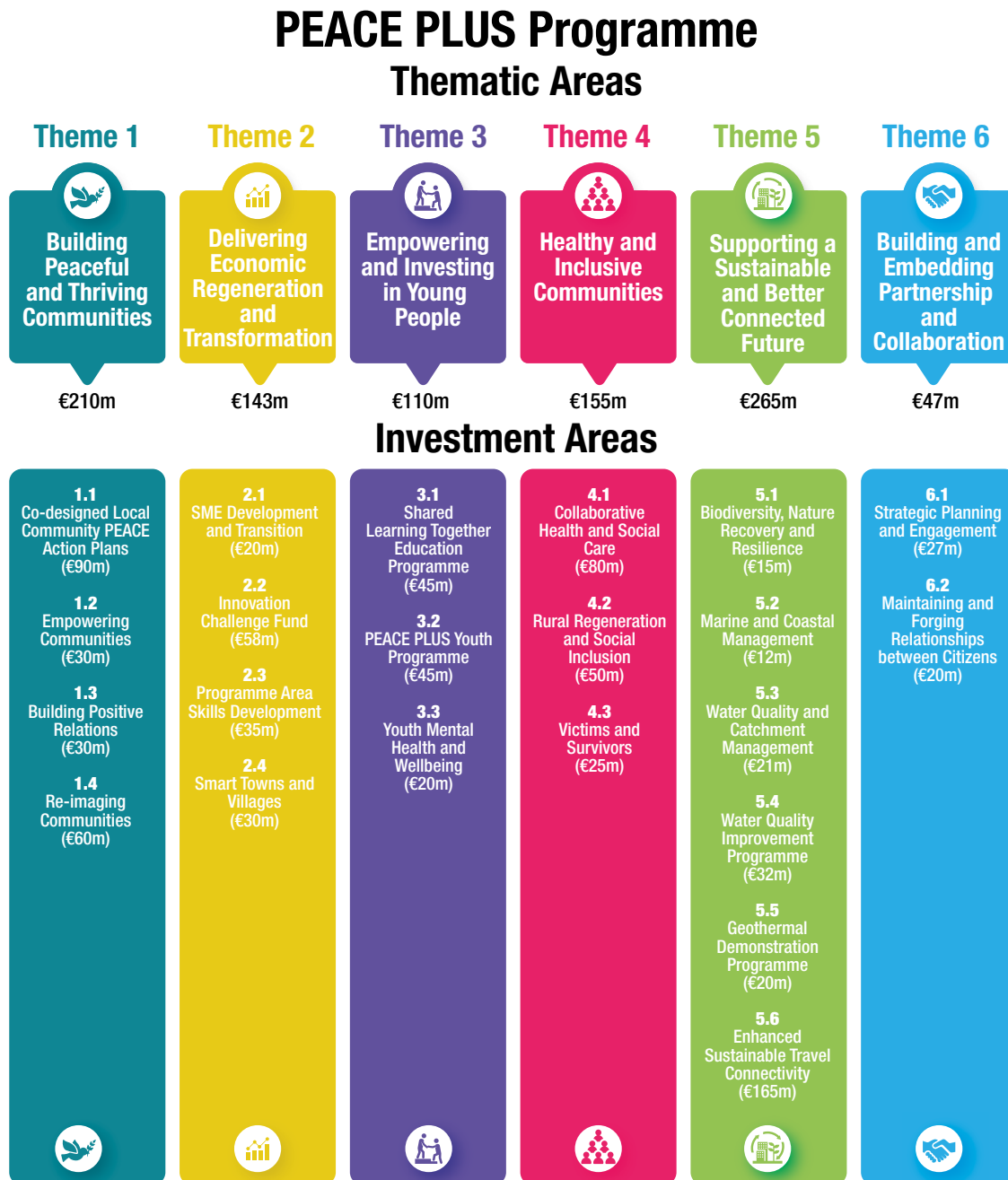
Figure 3 Detail of THEMES, INVESTMENT AREAS AND INDICATIVE ACTIVITY

There are a range of Investment Areas / Specific Objectives associated with each of these Thematic Areas. An indicative budget allocation has been assigned to each Investment Area of the Programme, and each Theme is described over the following pages.